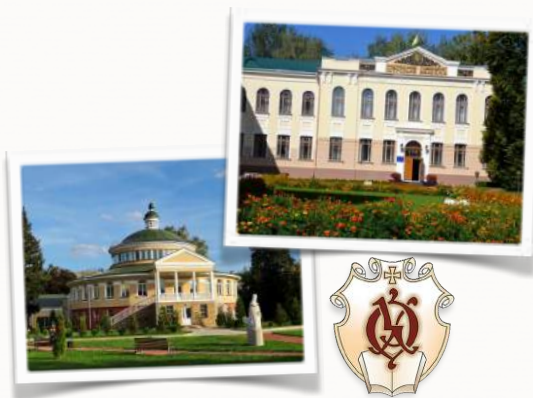
National University of Ostroh Academy Ostroh, Rivne Region, Ukraine

The Ukrainian Institute in Sweden in collaboration with the National University of Ostroh Academy in Ukraine are pleased to invite you to take part in the Ukrainian Language Summer School 2018.