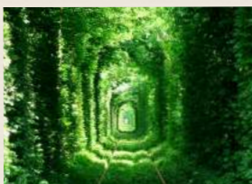
The Tunnel of Love, railway located in Rivne Region